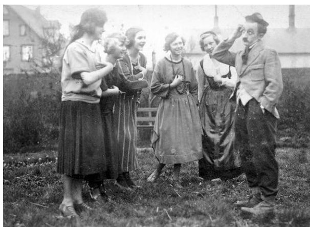
The Adventures of Jón and Gvendur (1923)

Today, the Icelandic film industry is blossoming; not only does the country distribute four domestic films per year (give or take), but international production companies, such as 20th Century Fox and Lucasfilm Ltd, are now swarming to the country to photograph the science-fiction-esque landscape. Such recent productions as Star Wars: Rogue One , Prometheus , and The Secret Life of Walter Mitty have all chosen to stage their shoots here, in part due to the attractive 25% rebate offered to filmmakers shooting in the country. This does not detract from Iceland's homegrown talent, nor the domestic film industry.