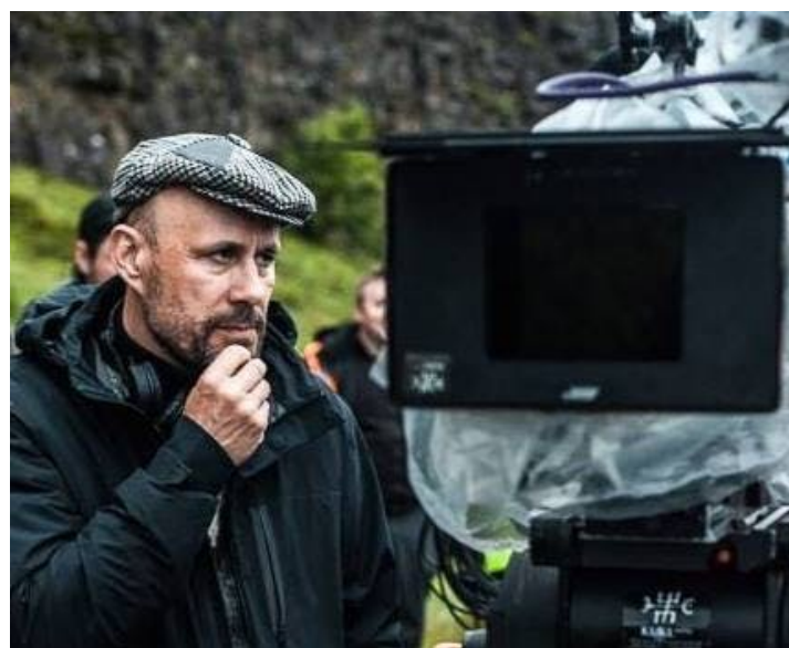
Benedikt Erlingsson, director of Woman at War

The film industry in Iceland is supported by the Bíó Paradís ("Cinema Paradise"); an independent Art House cinema in downtown Reykjavik that, since 2010, has focused its screenings towards the latest experimental releases, be they Icelandic or international productions. The cinema is the gathering point for numerous festivals, the most important being the Reykjavik International Film Festival, an event that lasts for eleven days, focuses on emerging talent and distributes filmmaking awards, most notably the Discovery of the Year Award, otherwise referred to as the Golden Puffin. The festival was conceived of in 2004 by a group of cinema enthusiasts looking to not only boost the film culture of Iceland but also to draw an international crowd.